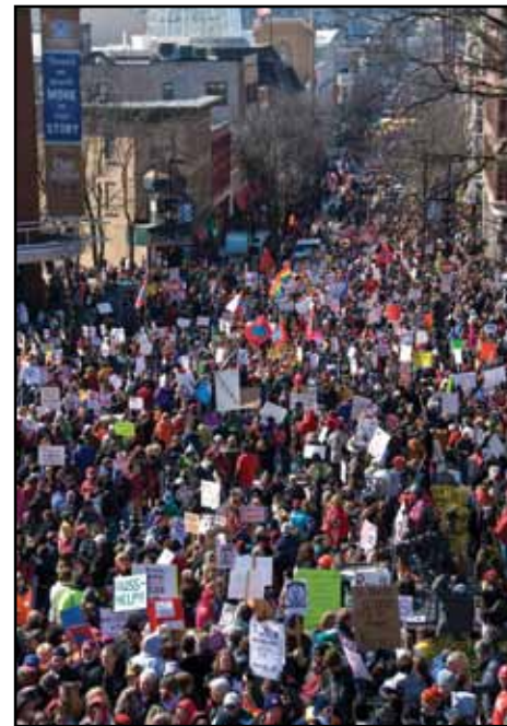
Over 100,000 strong in Madison, March 12.

No matter how much we reduce worker compensation and taxes, we will not be able to compete with low-wage countries where workers make less than a dollar an hour. The only way we can compete is by investing in a workforce providing skill, innovation, service and quality.