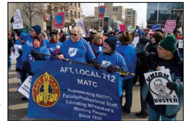
L212 members march in Madison on Saturday, March 12.

Walker is using the existence of a deficit to implement an extreme anti-education, anti-worker agenda that will redistribute income from Wisconsin's middle class to its corporations and the wealthy. That's why he cut corporate taxes by more than