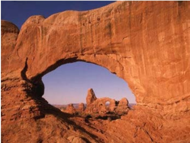
Arches National Park opens windows to the wonders of Nature!

This extraordinary 15-day field course is ideal for students who would like to earn four science credits while participating in an unforgettable learning adventure in some of America's most spectacular national parks and monuments (including Bryce, Zion, Grand Canyon and Arches).